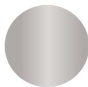
Precious Silver Pearl